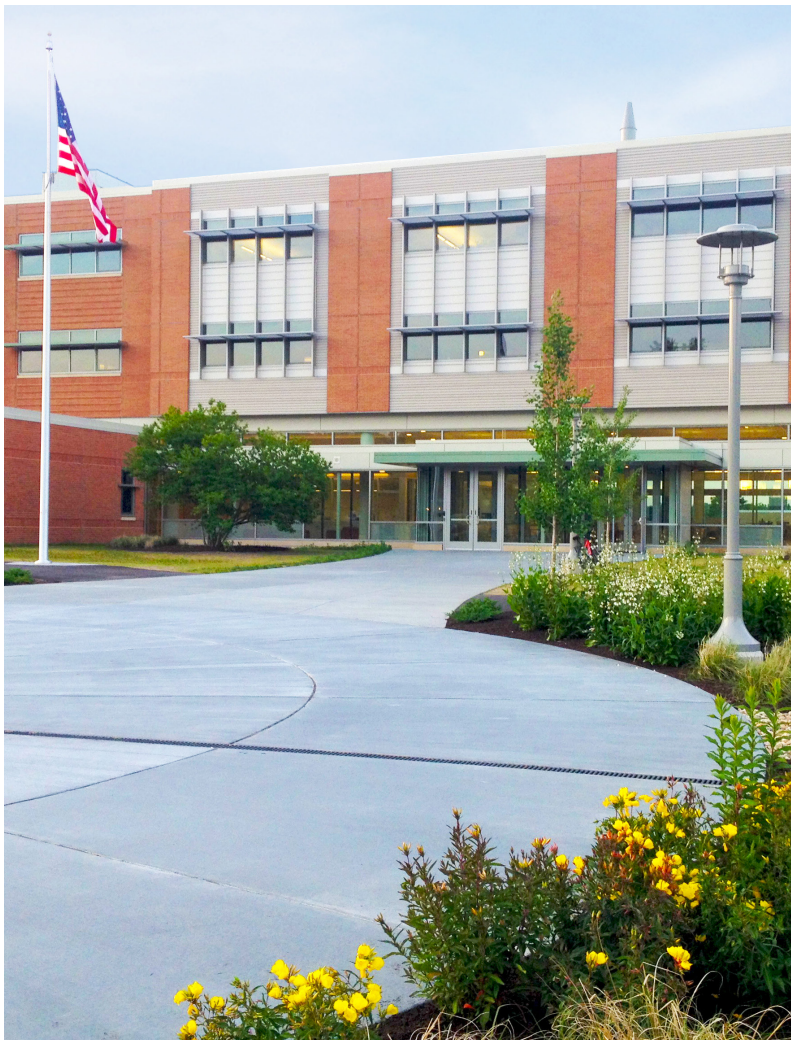
Concord-Carlisle High School Concord, Massachusetts