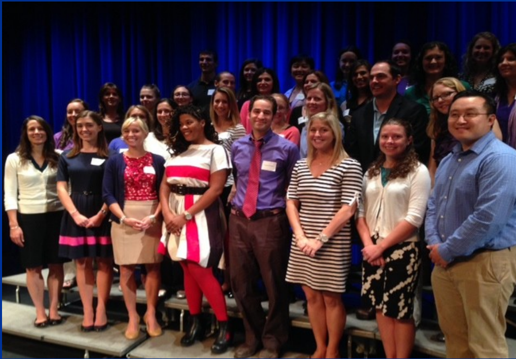
Professional Teacher Status Ceremony – September 26, 2013