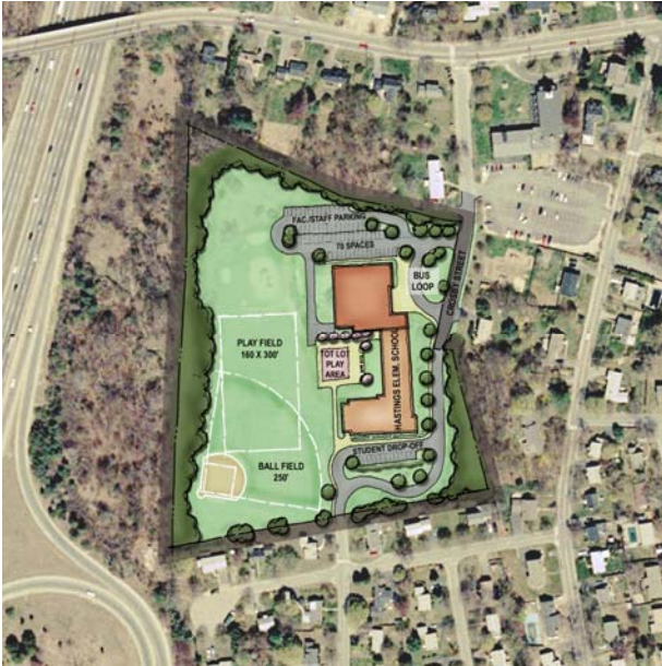
I. Add / Reno