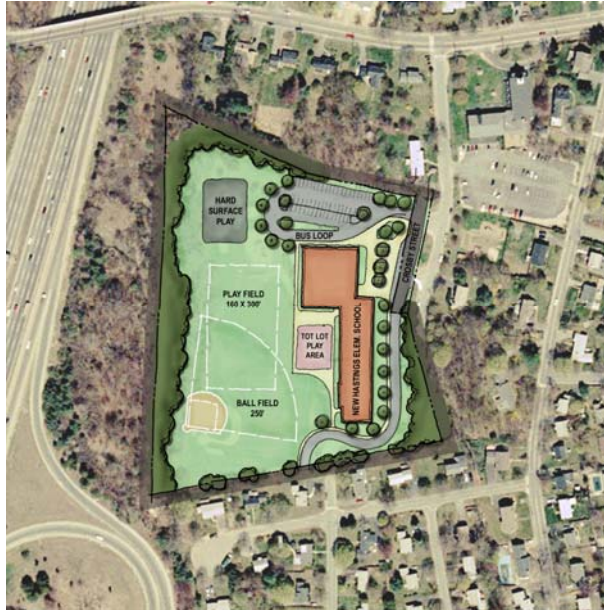
II. New Construction